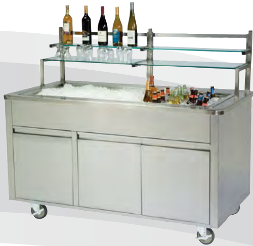
Back Bar (#79863)