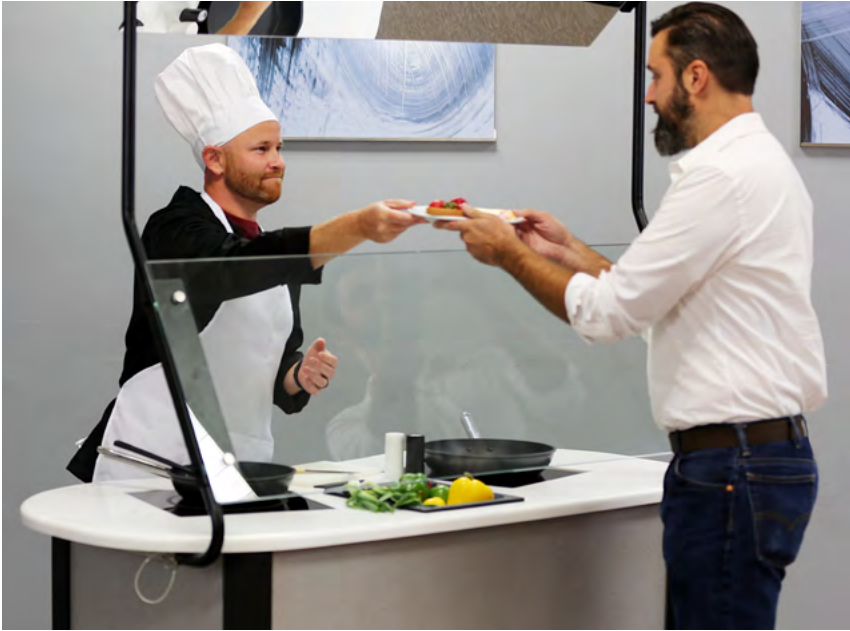
Action Station (#79502)