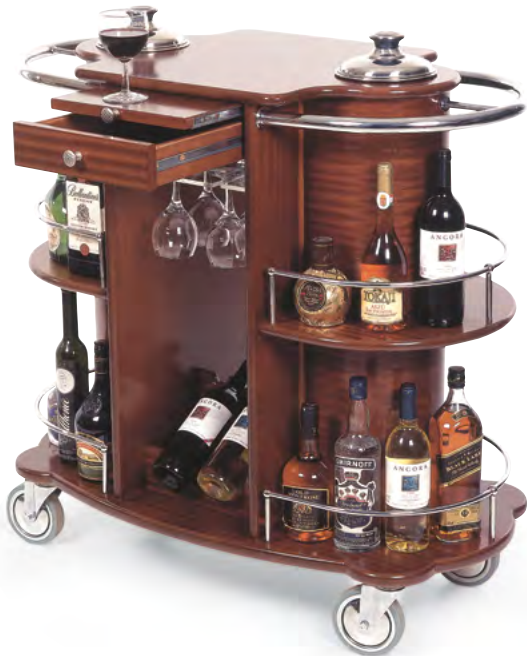
Liquor & Wine (#70260)