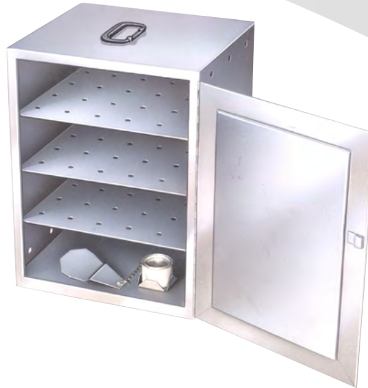
Food Carrier Boxes (#75112 & #75113)