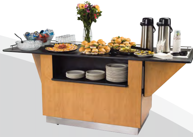
Breakout Dining Station (#79685)