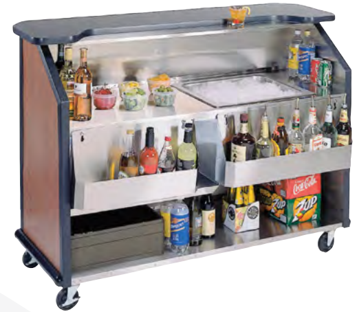
Portable Beverage Bar (#76887)