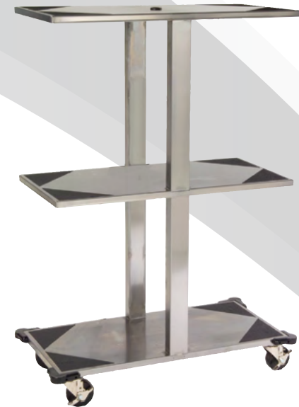
Racks (#74550 & #74555)