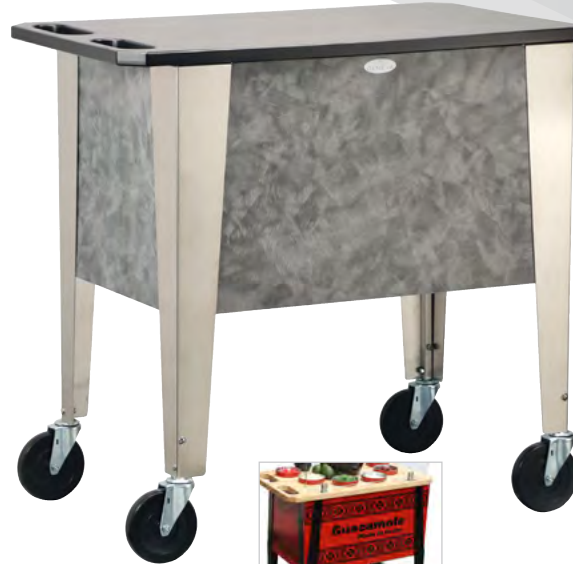
Tableside Guacamole (#39105)