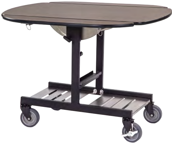
Room Service Table (#74420)